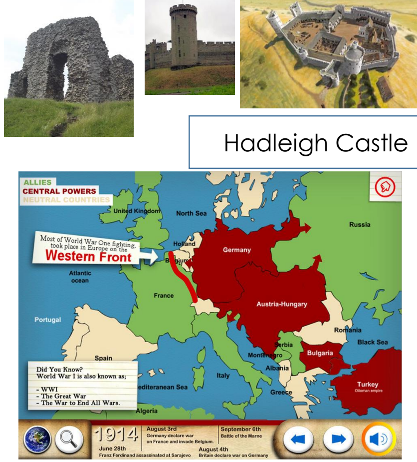
Map of WW1 Europe